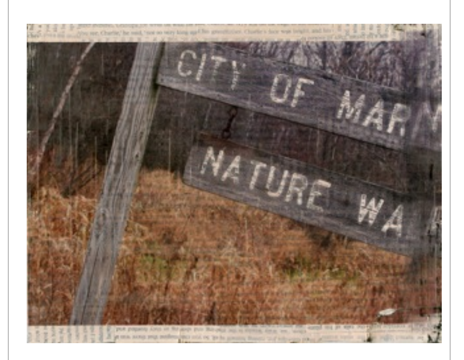
Digital Substrate by Ally Pfister, PHS Visual Art Student