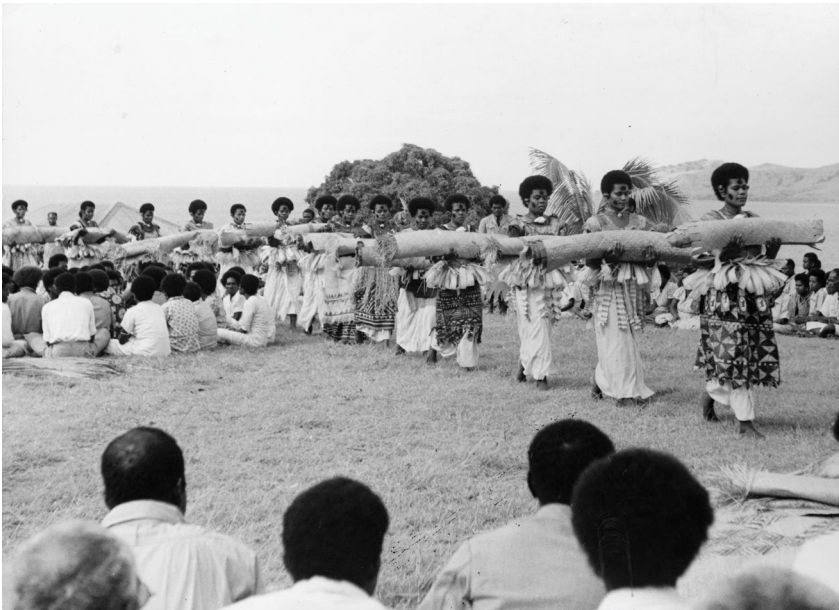
Presentation of Fijian mats and tapa cloths to Queen Elizabeth II during the 1953-4 royal tour

223. Presentation of Fijian mats and tapa cloths to Queen Elizabeth II. Fiji, Polynesia. 1953 C.E. Multimedia performance (costume; cosmetics, including scent; chant; movement; and pandanus fiber/hibiscus fiber mats), photographic documentation.