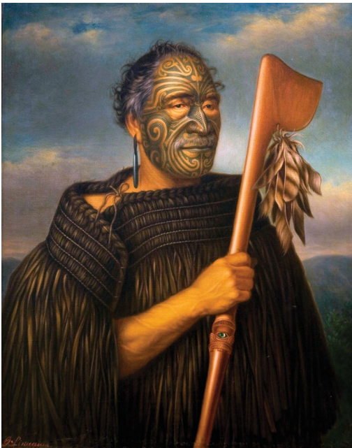
Tamati Waka Nene

220. Tamati Waka Nene. Gottfried Lindauer. 1890 C.E. Oil on canvas.